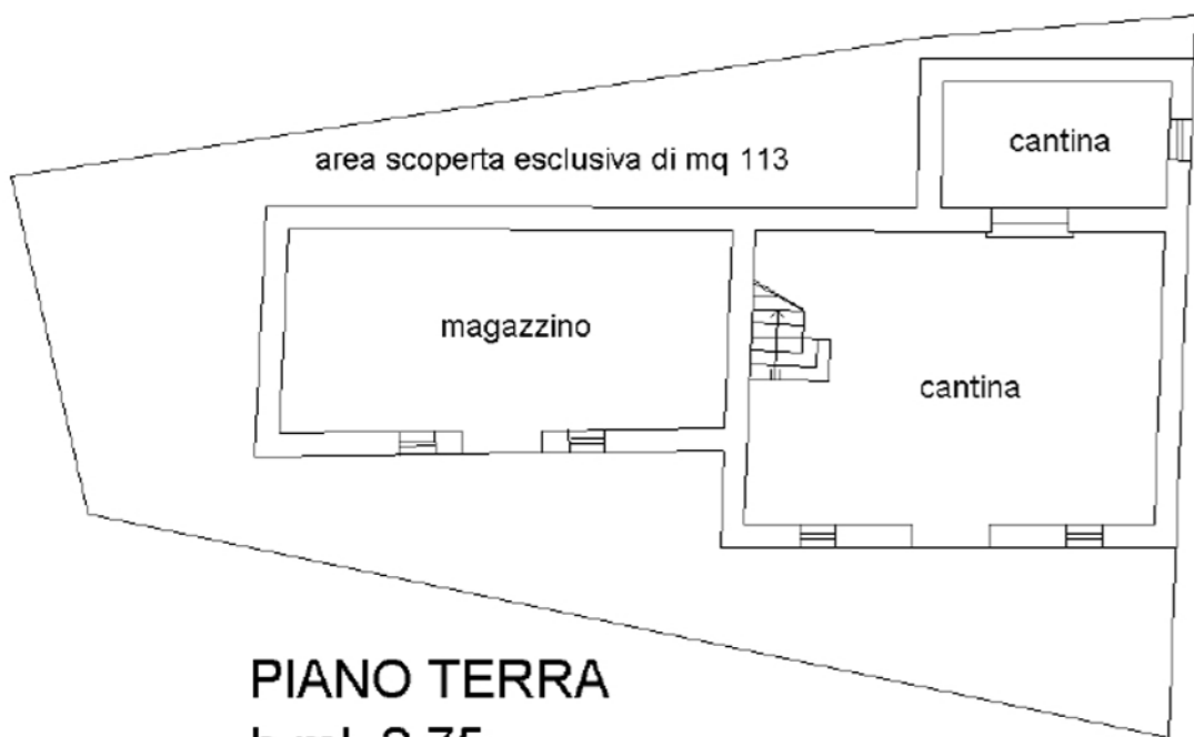
PIANO TERRA h ml. 2.75