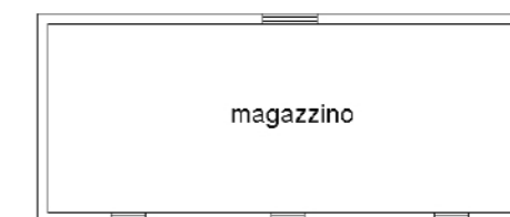
PIANO PRIMO h ml. 3.20