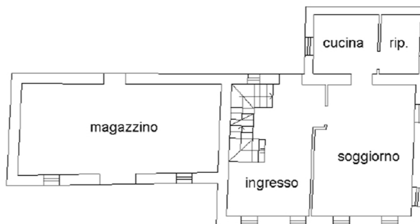
PIANO PRIMO h ml. 2.30